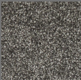
MEDIUM GREY 71