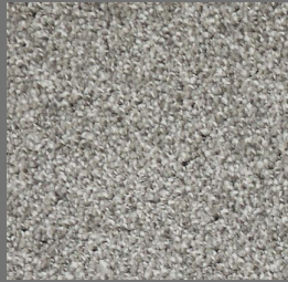
LIGHT GREY 75