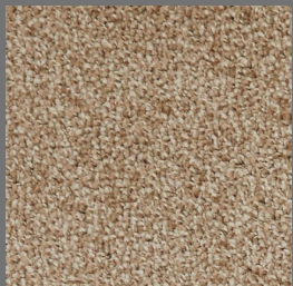
LIGHT BROWN 91