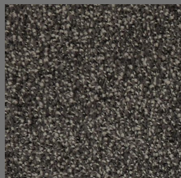
DARK GREY 76

For accurate colour references, please refer to a sample swatch.