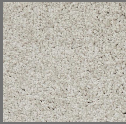
SILVER WHITE 61