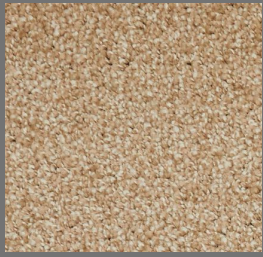
DARK CREAM 93