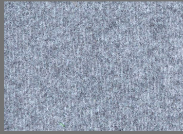
LIGHT GREY 73