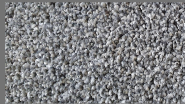
MEDIUM GREY 75