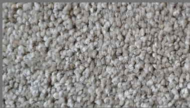
MUSHROOM BROWN 67