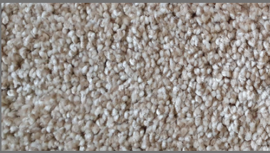
LIGHT BROWN 63