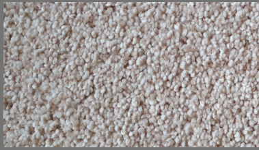
LIGHT BEIGE 61