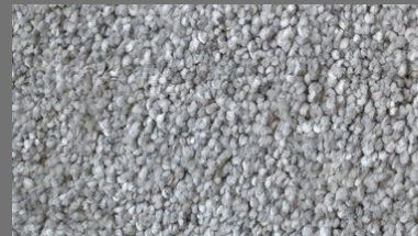
LIGHT GREY 73