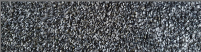
DARK GREY 78