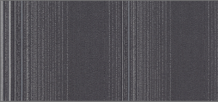
GREY BLACK 010