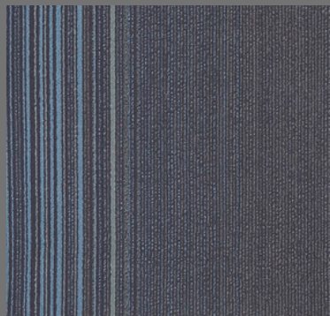
BLUE GREY 08