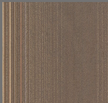
BROWN BEIGE 01