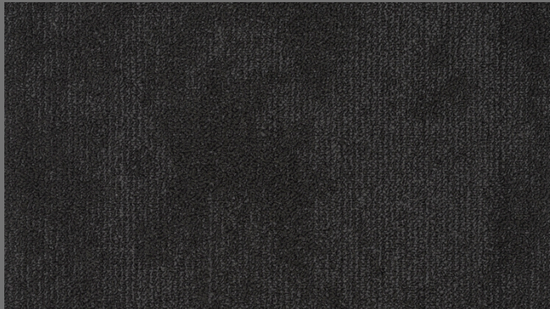
MEDIUM GREY 002