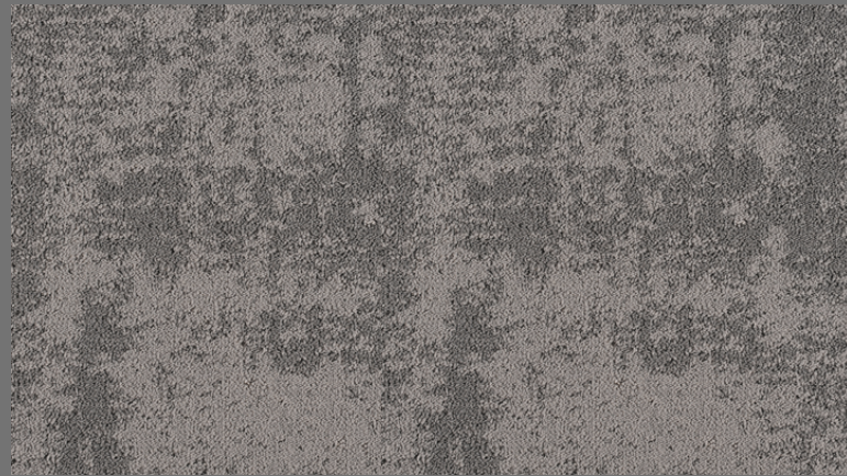
DOVE GREY 201